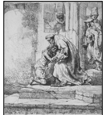
One preparation guide for the Advanced Placement Literature and Composition exam lists more than 100 allusions students should know—sixty percent are Biblical references, including the Prodigal Son (depicted above in Rembrandt’s Return of the Prodigal Son , 1636, etching).

For more information and the national report, go to www.bibleliteracy.org . ■