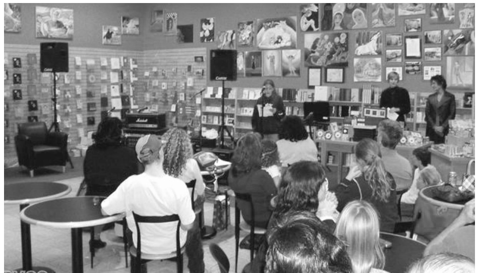
Students of River Valley Charter School performing at a local bookstore.

75-minute core class twice a week. Because teachers teach every day, class sizes are halved, ranging from ten to eighteen students. This allows teachers to engage